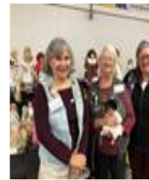
Wagon Wheel Dollers