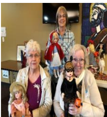
Kitsap Doll Club