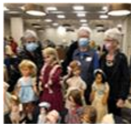
Seattle Doll Show