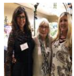
Mother & Daughters

73 rd Convention St Louis Mo. August 2 – August 6, 2022 Find out more in information in Unity's News on the UFDCs Website and on the UFDC' Facebook page. And make sure to watch the video! www.ufdc.org/convention