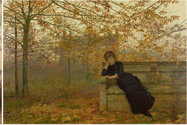
"Autumn Regrets" Grimshaw